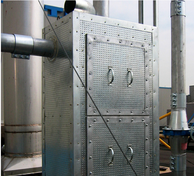
A blast enclosure for rooftop equipment.