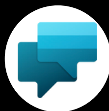
Power Virtual Agents Intelligent bots