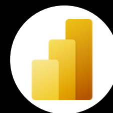
Power BI Business analytics