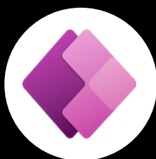
Power Apps Application development

Build business solutions fast, intelligently, securely, and without limits using a comprehensive combination of low-code tools.